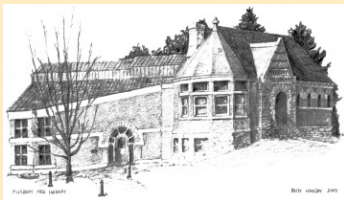
PILLSBURY FREE LIBRARY Warner, New Hampshire