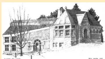
PILLSBURY FREE LIBRARY Warner, New Hampshire