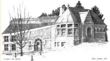
PILLSBURY FREE LIBRARY Warner, New Hampshire