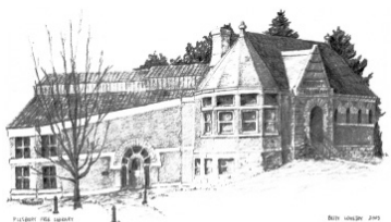
PILLSBURY FREE LIBRARY Warner, New Hampshire