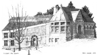
PILLSBURY FREE LIBRARY Warner, New Hampshire