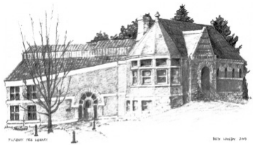
PILLSBURY FREE LIBRARY Warner, New Hampshire