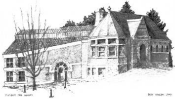
PILLSBURY FREE LIBRARY Warner, New Hampshire