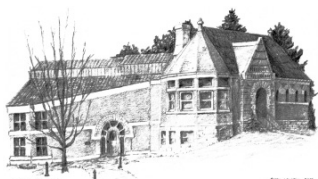
PILLSBURY FREE LIBRARY Warner, New Hampshire